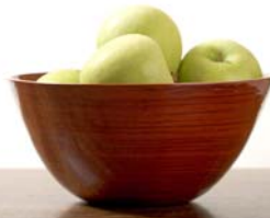
STORING APPLES AND PEARS